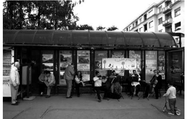
↳ Live concerts at bus stop