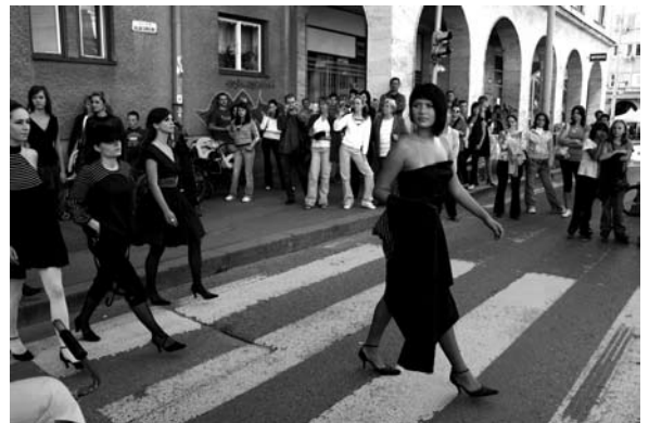
↳ Fashion show on zebra crossing

↳ Street as a dance floor with live music and DJs